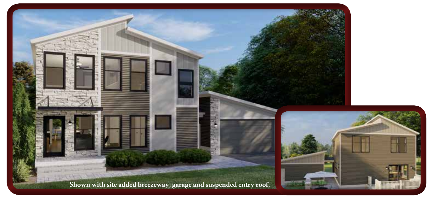
3 bedrooms and 2.5 baths • 2,148 SQ. FT.

3/12/4.5/12 sawtooth roof pitch; vaulted ceilings in Living Room. Open loft style floorplan.