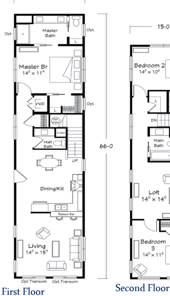
Bedroom 2 14° × 10° DN Loft 14° × 14° Bedroom 3 14° × 11²

3 bedrooms and 2.5 baths 1,860 SQ. FT. Shed Roof